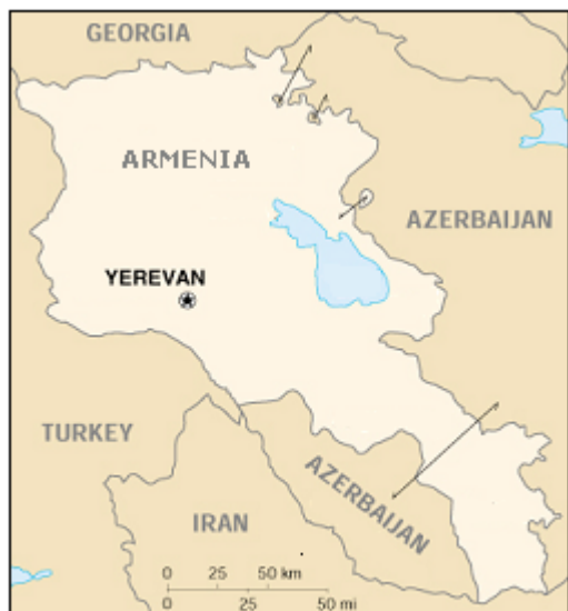
Current Map of Armenia

The Seljuk Turks began to inhabit Anatolia as early as the eleventh century and by 1453 their descendants, the Ottoman Turks, had captured Constantinople (now Istanbul), firmly establishing the Ottoman Empire. The Ottoman Empire was a multinational state that incorporated several ethnic groups including the Armenians. The Armenians were second-class citizens of the Ottoman Empire and while they were granted some freedoms, including the ability to practice Christianity, they were faced with extra taxes and discriminatory laws extending to their participation in the justice system, government, and their civil and property rights.