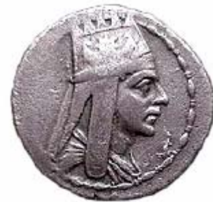
King Tigranes II. 95-96 C.E.

Christianity is a deeply rooted aspect of Armenian history and culture. Armenia was the first nation to adopt Christianity as a state religion, in 301 C.E. This early Christian identity has greatly influenced Armenian culture, setting it apart from most of its neighboring peoples. The majority of Armenians belong to the Eastern or Western dioceses of the Armenian Apostolic Church, an orthodox form of Christianity.